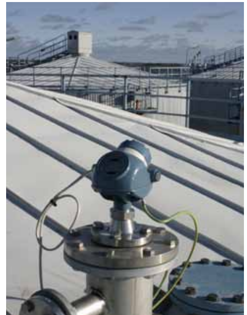
A 5400 level transmitter can have HART or FF output.

Rosemount 5400 allows continuous testing of the hi-hi level transmitter.